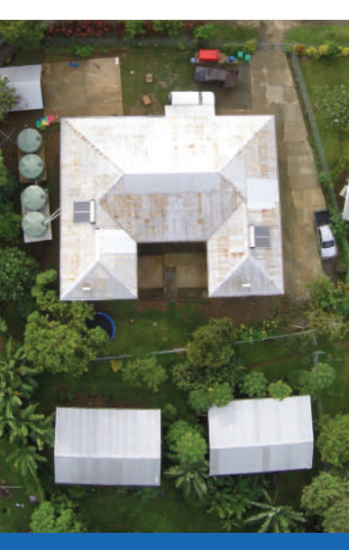
Aerial view of current compound